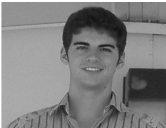
Valedictorian - Yuba City High School Class of 2006