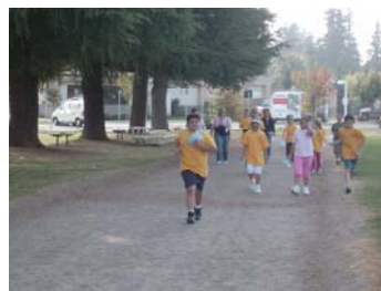
Just one more lap to go!